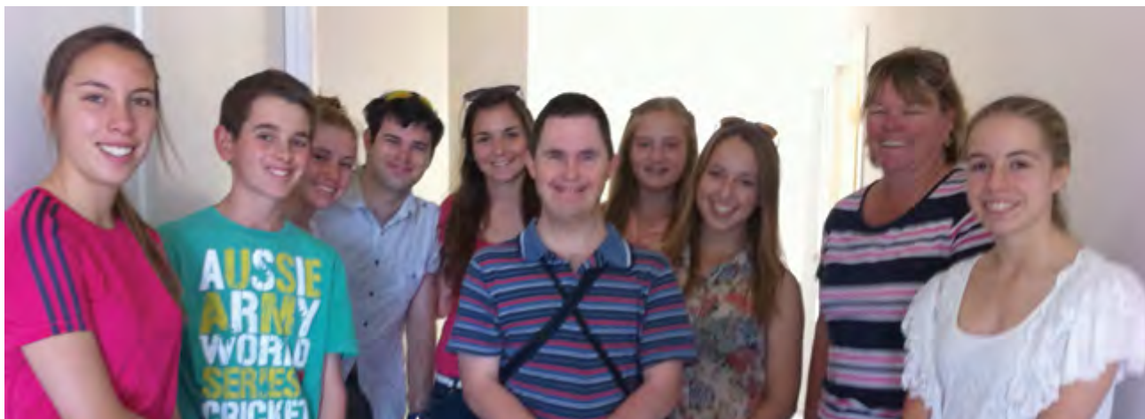
Leo members visited Granite Belt Support Services for their Open House day in October.