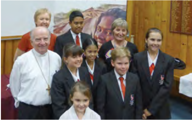
Some of the participating student leaders with Bishop McGuckin at the Project Compassion launch