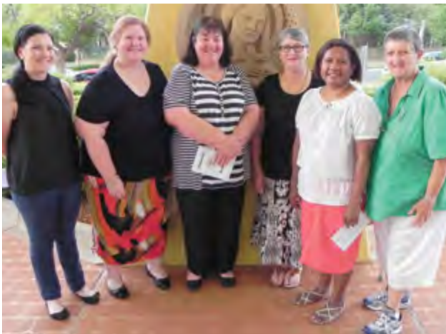
RCIA candidates and team

In recent months members of St Theresa's community has had the opportunity to celebrate life in a variety of ways. On Sunday morning of the 26th January, the community celebrated the diversity of life and people in this country with a moving liturgy followed by service of damper and tea by members of the Hospitality and Welcome team.