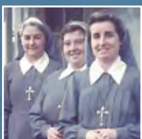
Missionary Sisters of Service Celebrate 50 Years.