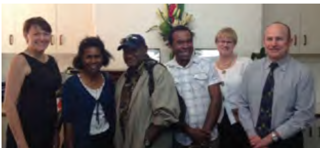
Staff from the Catholic Education Office meet up with OLSH friends