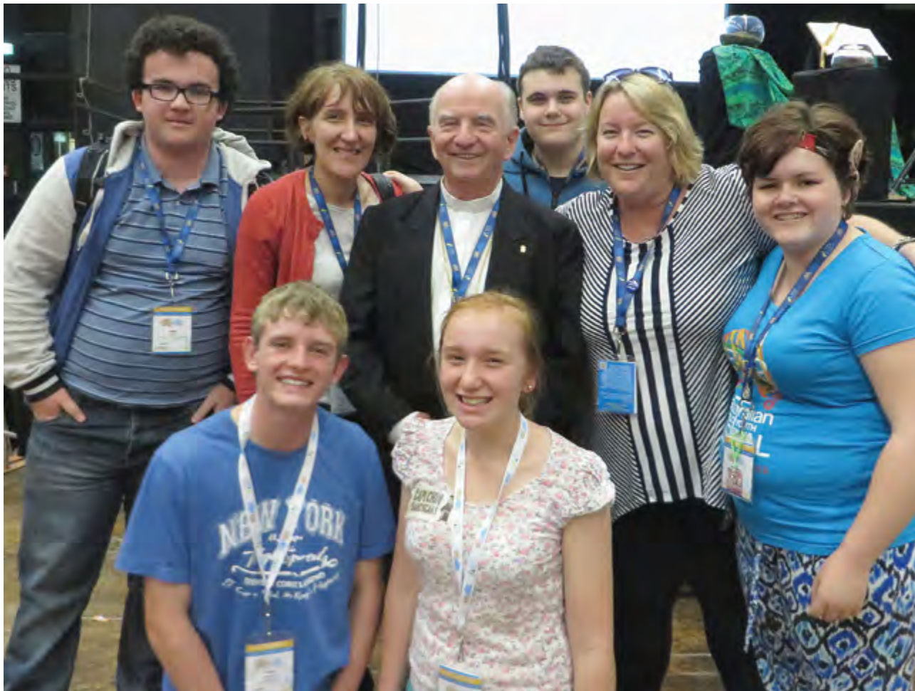
Bishop McGuckin with the Diocese of Toowoomba group at the Festival.

Excited and enthusiastic youth from across the Toowoomba diocese joined over 3000 other young pilgrims from around Australia in Melbourne for the inaugural Australian Catholic Youth Festival. It was the largest national gathering of Catholic young people since Sydney's World Youth Day in 2008.