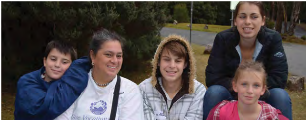
Supporters of the John Wallis Foundation participating in a Tasmanian Bike Ride

The Missionary Sisters of Service (MSS) celebrates its 70th anniversary of foundation this year. In conjunction with this milestone, the newly-formed John Wallis Foundation, founded by the MSS, invites applications for its first round of grants.