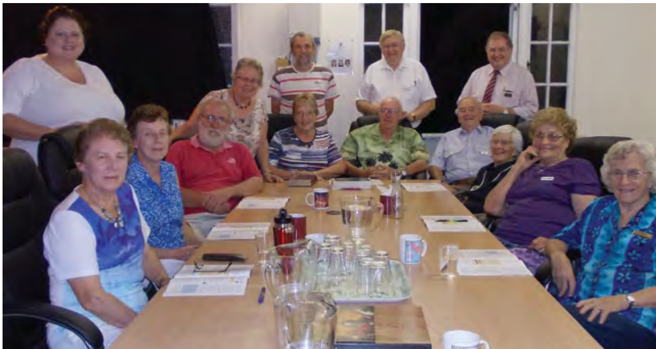
Participants from the various churches gathered for the Lenten program.

This year's Lenten journey in the Dalby and district community has taken on a new and exciting dimension.