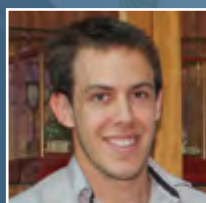
Innovative Coffee Outlet Wins Social Justice Award.