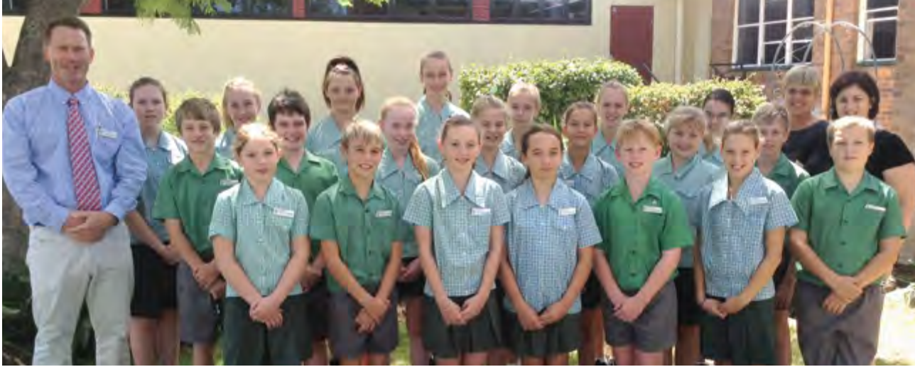
Student leaders and staff of St Stephen's Catholic School

On Friday 21 February, St Stephen's Catholic School held its opening Mass for the school year. At the heart of the school's Mass was the induction of student leaders for 2014, together with the announcement of the executive members who will assume leadership in the school's service based Mackillop Club. While the Mass was significant to the Year 6 and 7 students who were all inducted as school leaders, it was also significant in the fact that 2014 heralds the end of Year 7 in