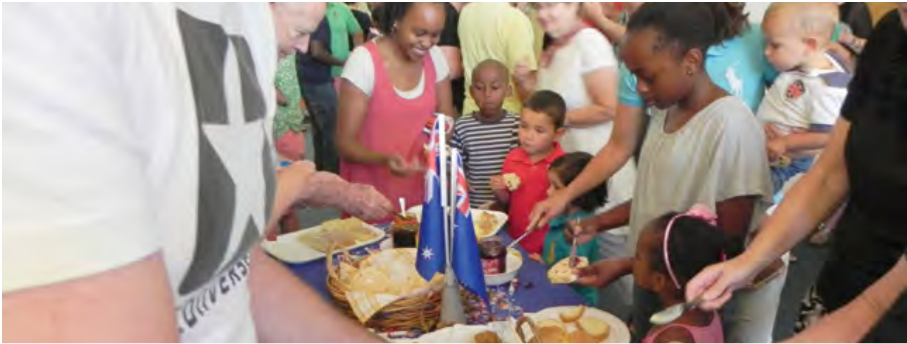
Australia Day festivities celebrated in the parish