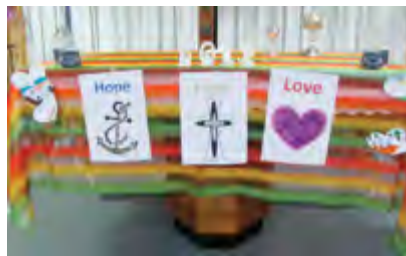
Pictured above is the altar for the school liturgy.

special blessing for the teachers who have the task of bringing a new generation of young people to 'become who they are' and take their place in the kingdom. This text fitted in well with the school liturgy held on the Friday where the theme was love and its importance in our lives. The children made appropriate decorations to fit the them.