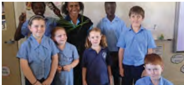
Grace and students from Our Lady of Lourdes