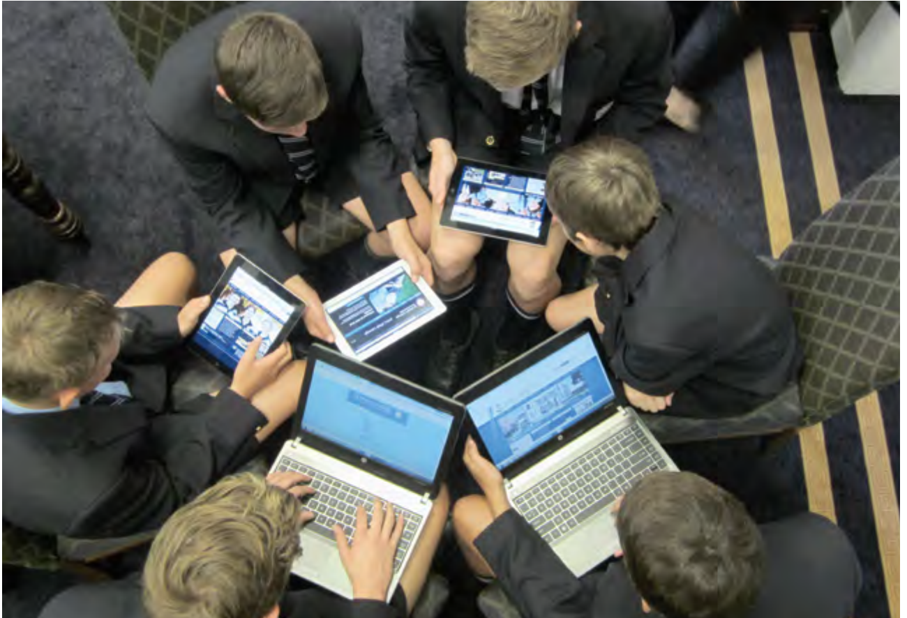
St Mary's College students diligently honing their skills on the new Apple iPads