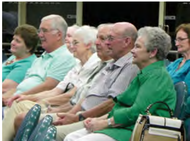
Irish night attendees enthralled by music and entertainment